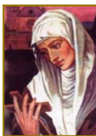
St. Agnes of Assisi