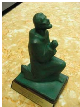
U.S. Secular Franciscan Order National Peace Award