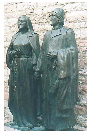
Pica, holding chains, and Bernadone, Francis' parents

All this strengthened Francis in alacrity to carry through his resolution and he patiently endured the blows and hard words. When his father had to leave home on urgent business, his mother, who disapproved of her husband's action, reasoned gently with her son. But when she saw that nothing would move him from his good