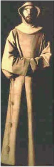
By Francisco de Zurbaran