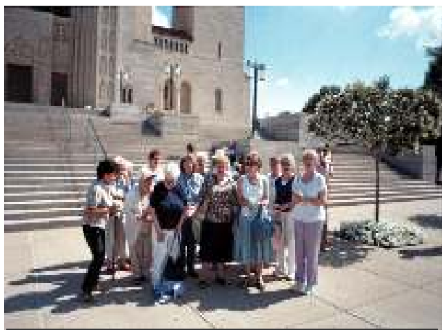
Little Flower Fraternity members enjoyed a recent bus trip to DC to visit the Franciscan Monastery, Cap College, and the Basilica of the National Shrine of the Immaculate Conception. T